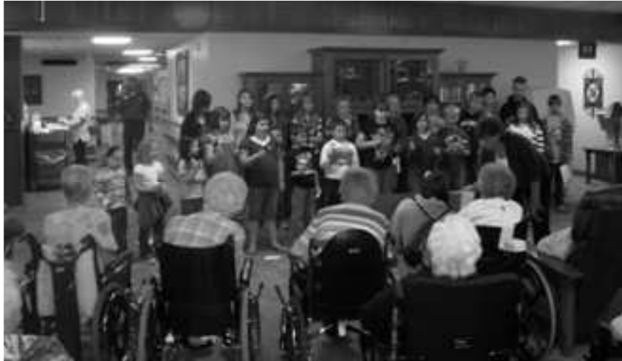
Entertaining — Zion Lutheran School students sing for residents.