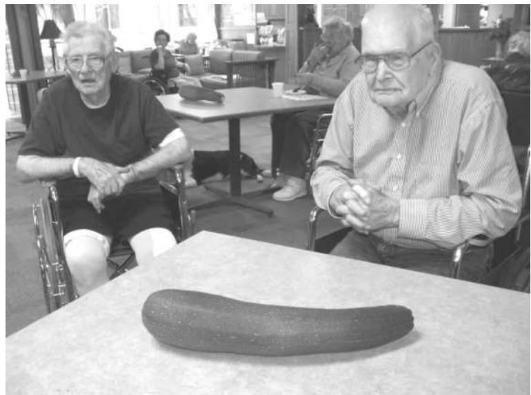
Sampling Zucchini — Residents enjoyed sampling recipes made with zucchini.