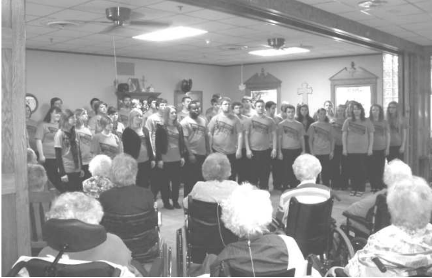
Filling the day room with beautiful music — The Evangel College Choir from Missouri performed for residents while in town for a concert. What beautiful music!

On Tuesday, Oct. 20, the residents, staff and visitors were treated to a special concert hosted by the Evangel University Concert Choir. The college is located in Springfield, Mo. The choir included 44 students, who come from all parts of the country. Their choir is energetic and unique in many ways. They were kind enough to stop by Gardenside after a concert at a local church and school before leaving town for the next stop on the tour. After the performance, the students went around to meet and greet residents in attendance that day. It was remarkable to see such talented young adults with such powerful voices. We were honored to have them sing for us!