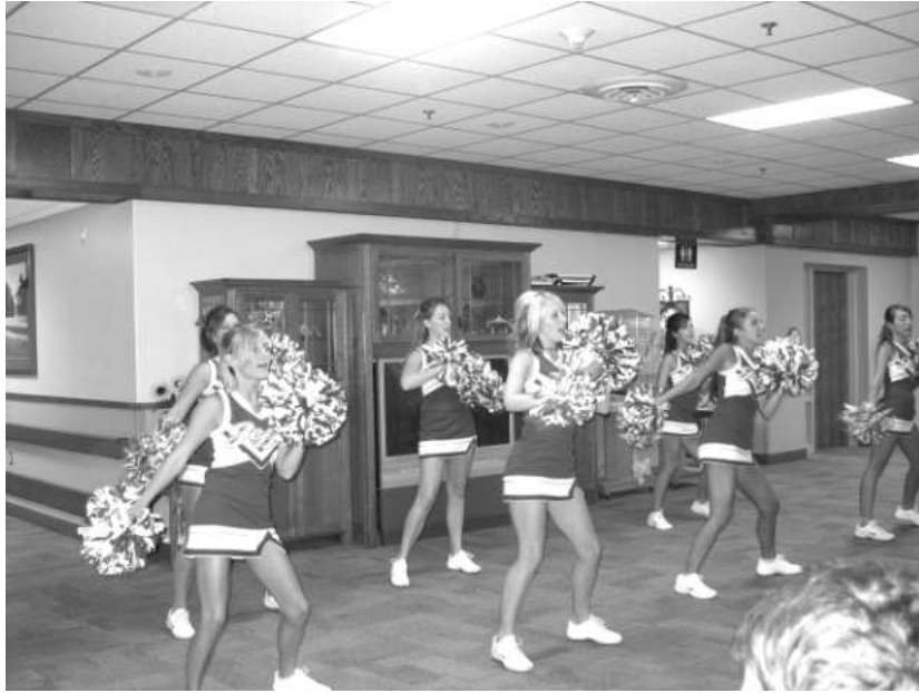
Cheering for the team — Fairbury High School cheerleaders give a cheer for residents.